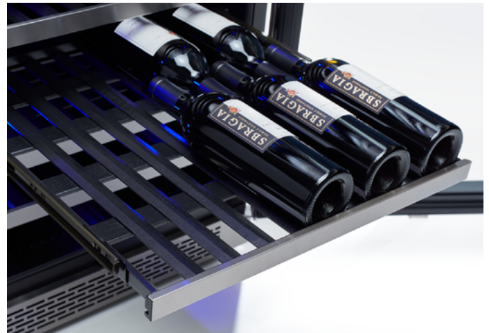
Full-Extension Wood Racks