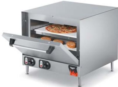
Cayenne® Pizza/Bake Oven