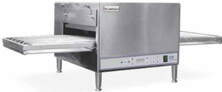
Shown with 50" (1270 mm) extended conveyor.