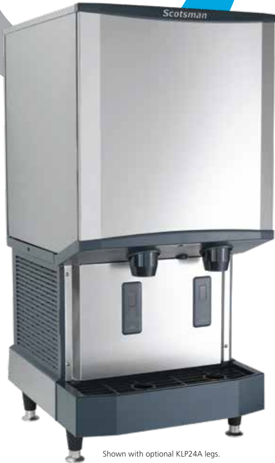
Shown with optional KLP24A legs.