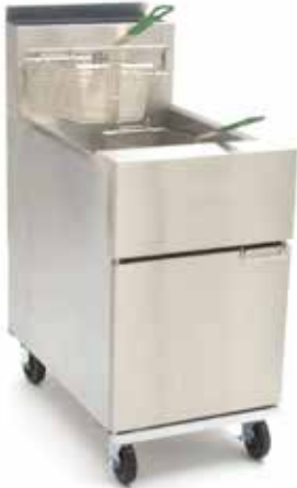
SR62G Shown with optional casters.