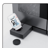
SOLID CAL (only for models with boiler)