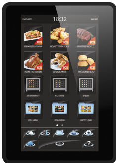
LCD 10" Touch Screen