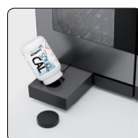
SOLID CAL (only for models with boiler)