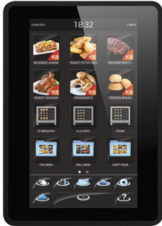
LCD 10" Touch Screen