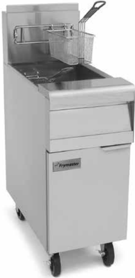
PMJ145 Shown with optional casters.