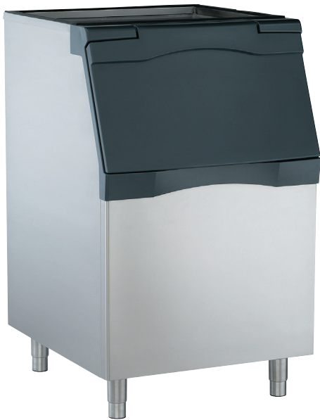
B530S shown with optional KLP8S legs