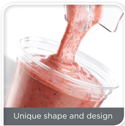
Unique shape and design